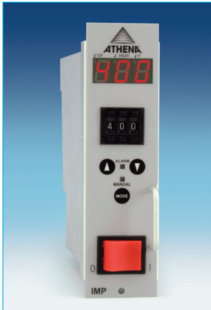
Fig 1. IMP Modular Controller showing single zone temperature control and 'thumbwheel' setpoint adjustment.