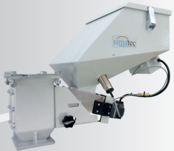
DVS with SENSOR LEVEL