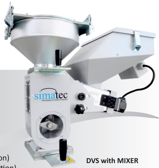
DVS with MIXER